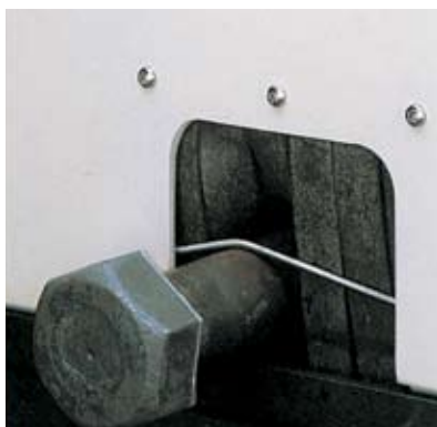
Rubber sealed side ports allow sectioning of long stock.