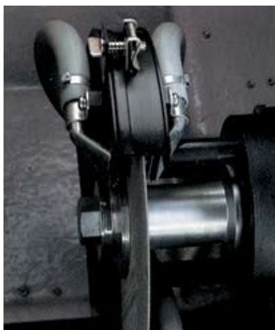
Twin hose jets apply coolant to both wheel and sample during cutting operation.