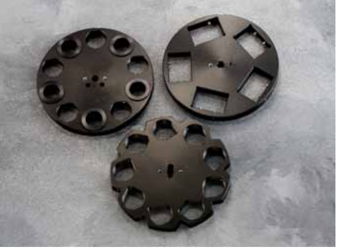
A variety of Specimen Holders are available for a multitude of sample sizes and shapes.