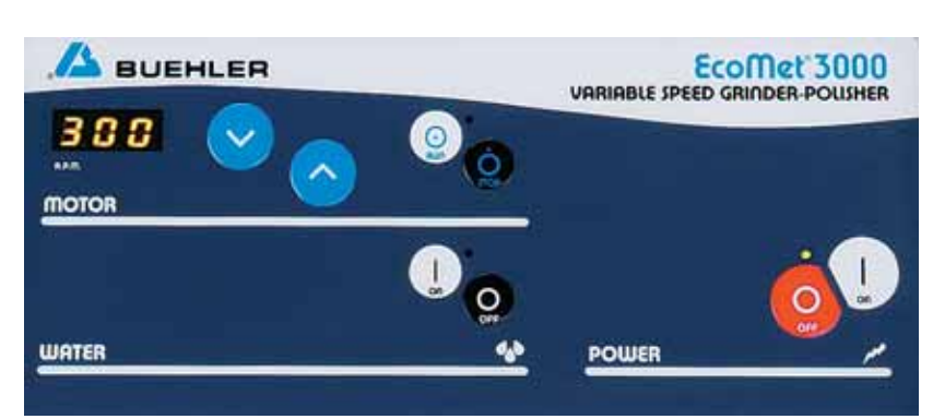
EcoMet® 3000 Grinder-Polisher Fascia