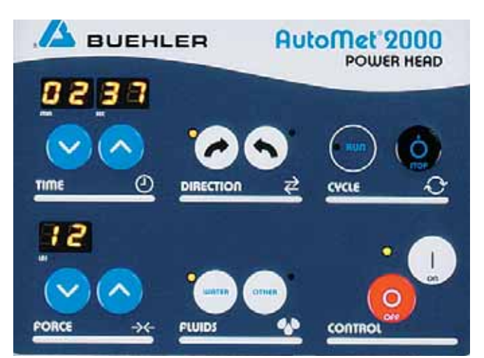
The front facia panel is easy to operate and allows control of \mathsf{AutoMet}^{\circ} 2000 functions.