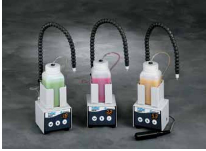
The \ensuremath{\mathsf{PriMet}}^{\circ}\ensuremath{\mathsf{Modular}} Dispensing Satellites can be purchased and used individually.