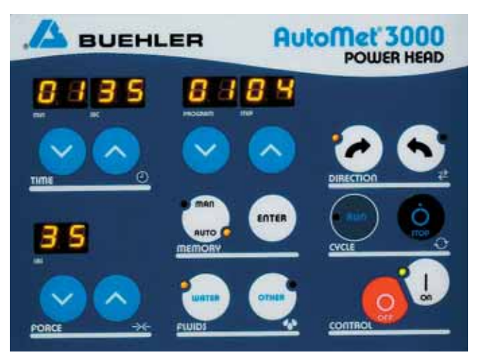
Programming the AutoMet ^{\circ} 3000 is made simple with the easy-to-read control panel.