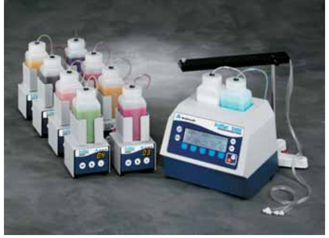
PriMet® 3000 Modular Dispensing System with PriMet® Modular Dispensing Satellites automatically dispense.