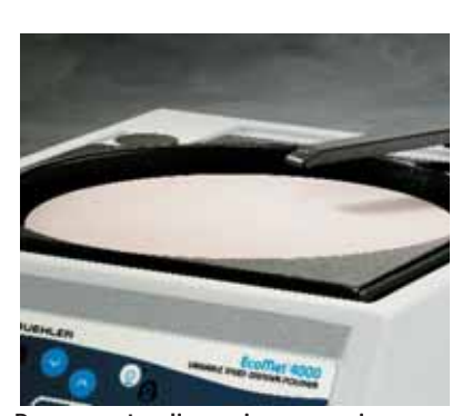
Pop-up water dispensing arm swings over any position on the platen.

EcoMet<sup>®</sup>4000: 20<sup>13</sup>/16″ W x 17<sup>13</sup>/16″ D (529mm x 453mm)