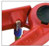
Special slot to crimp (0,5 - 4 mm 2 )