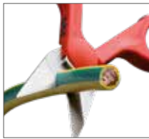
To cut Cu/Al cables up to 50 mm 2