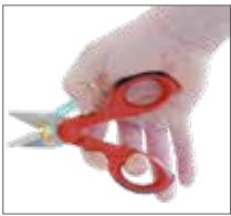
Special blade design: to cut and strip cables